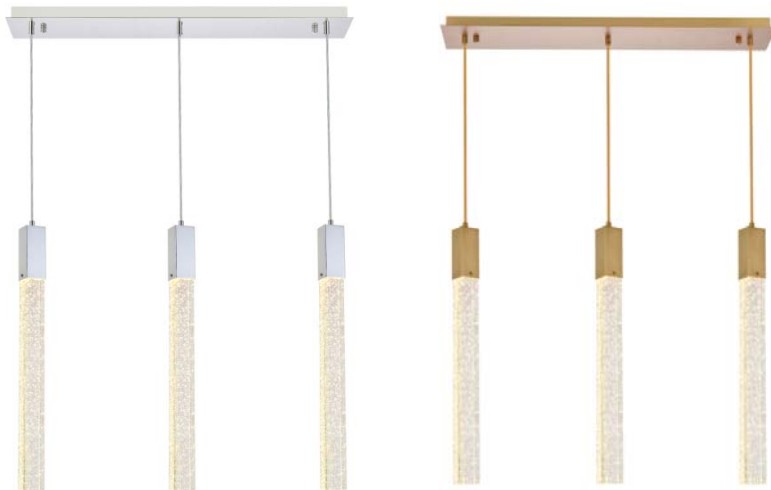
Chrome Item No: 2066S32C